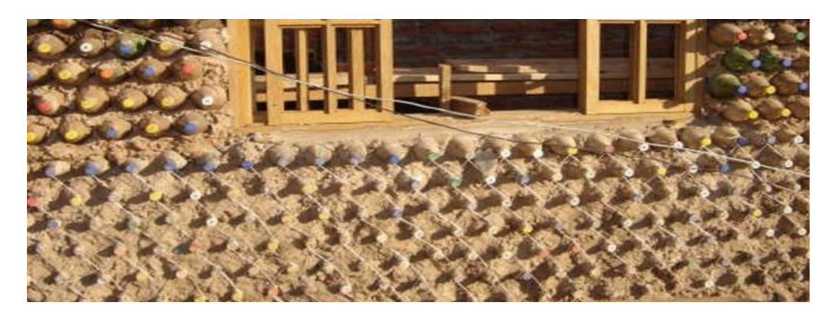
fig.1: showing brick replacing PET bottles

Method of replacing bricks with PET bottles only. Before using PET bottle, it is filled with soil or ash in the bottle.